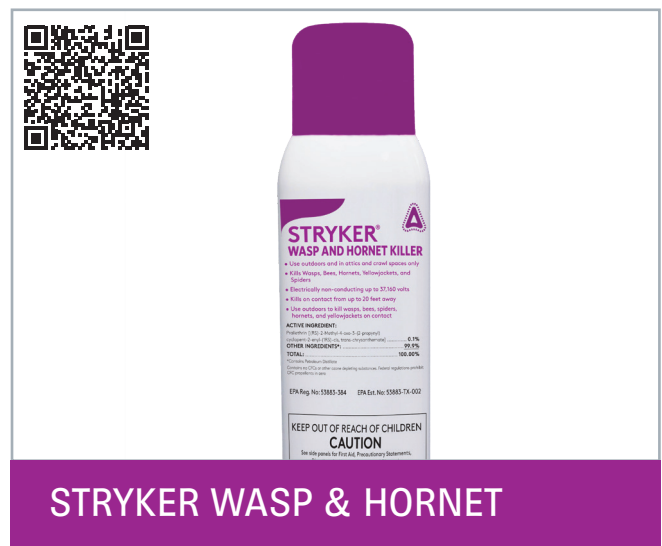
STRYKER WASP & HORNET

Ready-to-use aerosol that kills on contact from up to 20 feet away.