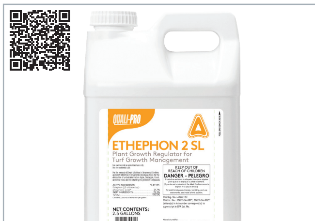
ETHEPHON 2 SL

Systemic, foliarly absorbed Type 2 PGR that promotes lateral growth in turf while limiting top growth and suppressing seedheads of Poa and white clover.