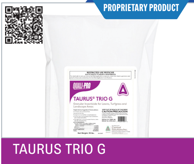
TAURUS TRIO G

Three-way granular insecticide delivers quick knock down of listed pests while providing long residual activity